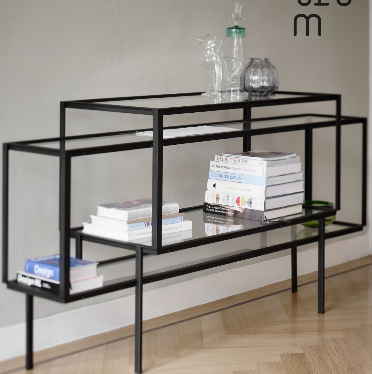
Tangled Cabinet Carolina Wilcke - 2015