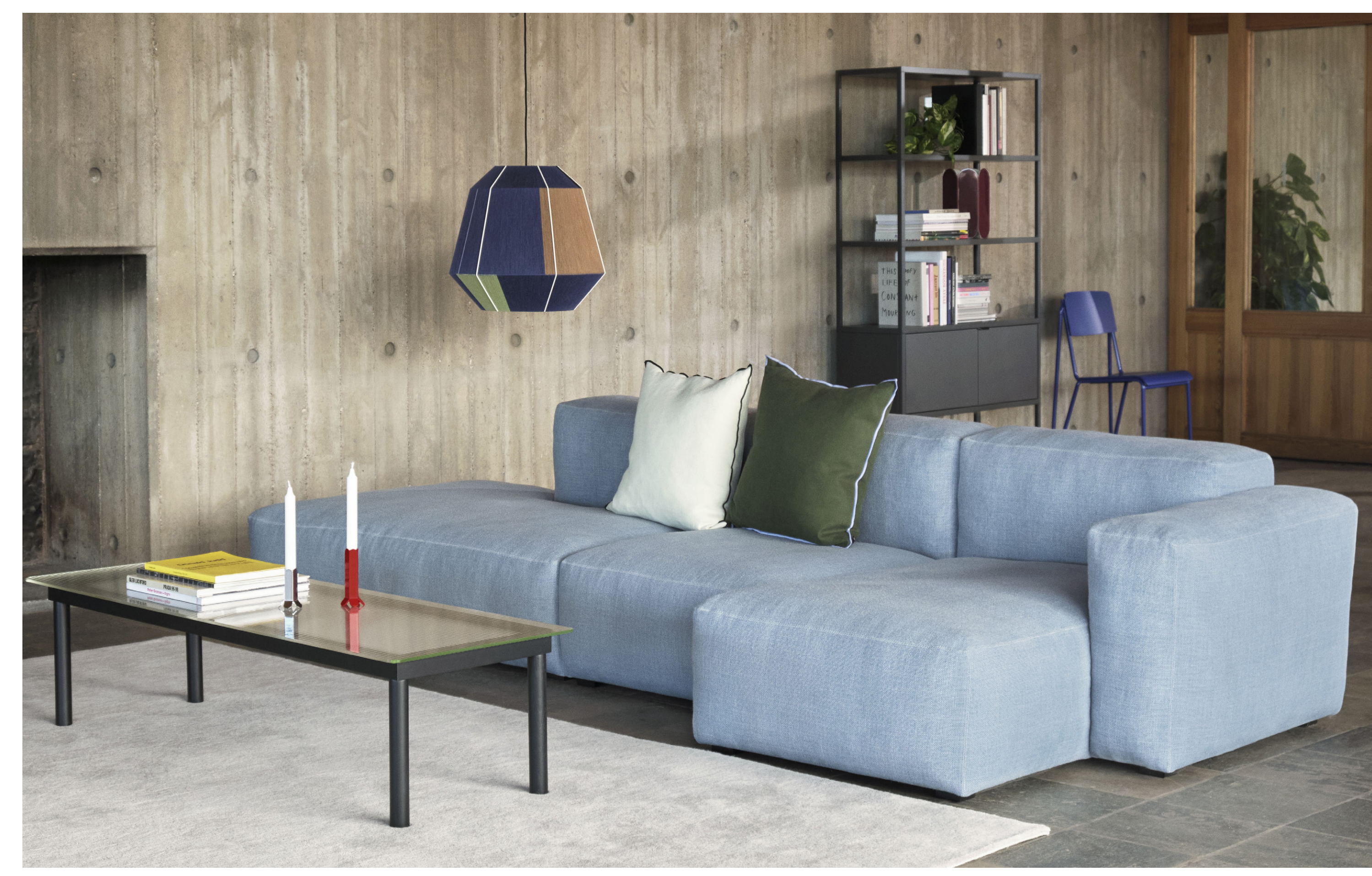
Linen Grid Blue